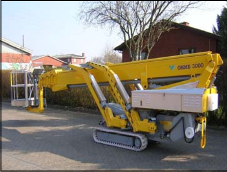
Custom lift trailer included, rents with or without operator

Our latest addition for rental is the Ommelift All Terrain Aerial Lift which reaches up to 102 feet. This makes getting up there easy and quick!