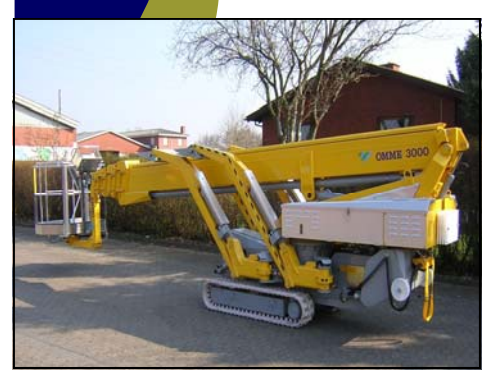
Custom lift trailer included, rents with or without operator

Our latest addition for rental is the Ommelift All Terrain Aerial Lift which reaches up to 102 feet. This makes getting up there easy and quick!